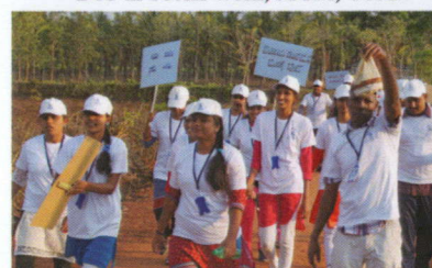
Social Work trainees participating in the Jatha as part of the Social Work Rural Camp.