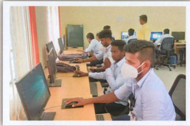
Students making use of the Computers for Digital Learning