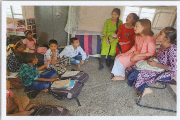
Social Work trainees educating the Tribal school children.