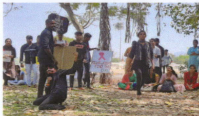
Awareness skit played by Social Work trainees in the University campus on the occasion of World Cancer Day 2020.