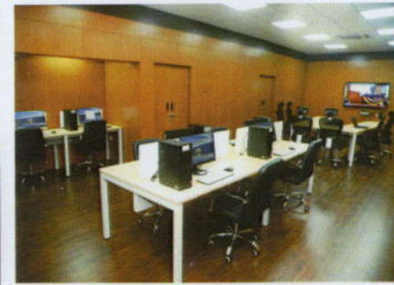
Video Conference Hall