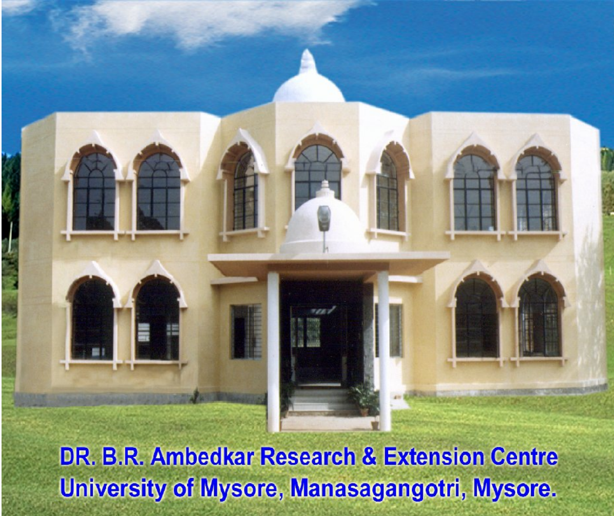
DR. B.R. Ambedkar Research & Extension Centre University of Mysore, Manasagangotri, Mysore.