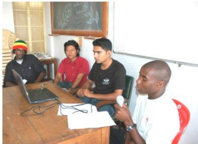
Recording for Radio Programme

Contact : Chairman, Department of Studies in Communication & Journalism, Manasagangothri, Mysore - 570 006 INDIA Ph : 91-821-2419511 / 516 Website : www.uni-mysore.ac.in