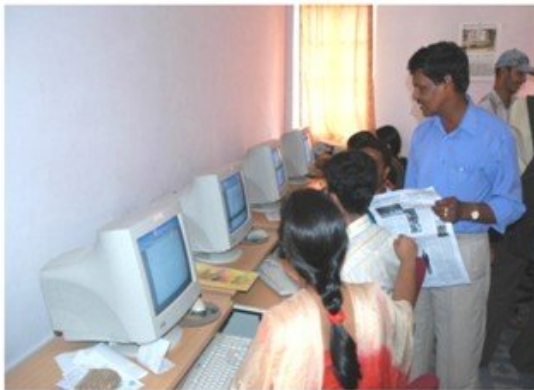
Production of Lab Journal