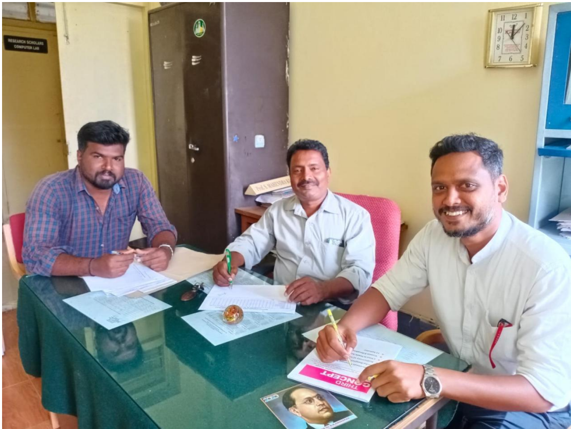
Guest Faculty Members and their Room