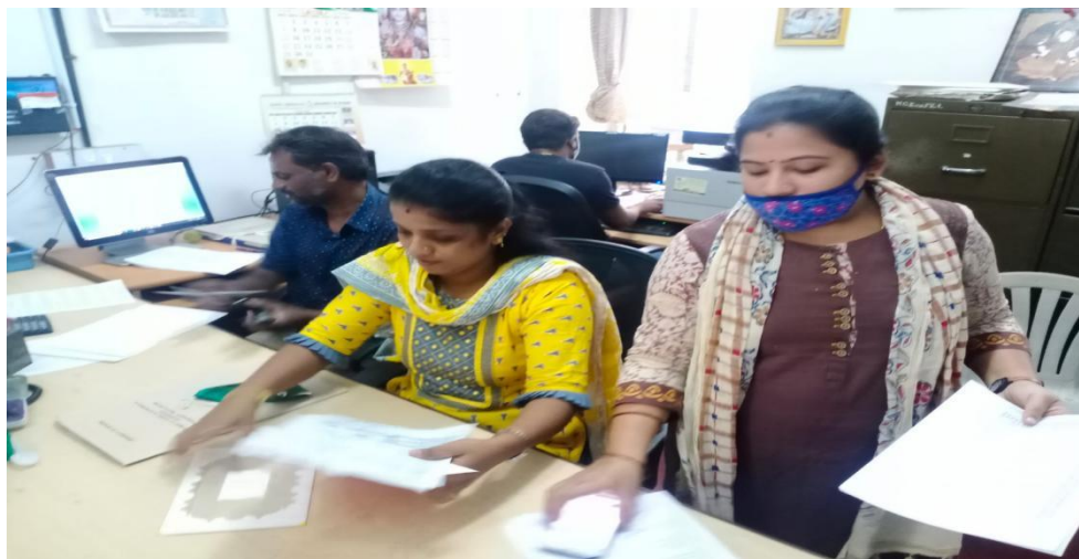
Office Room and Staff