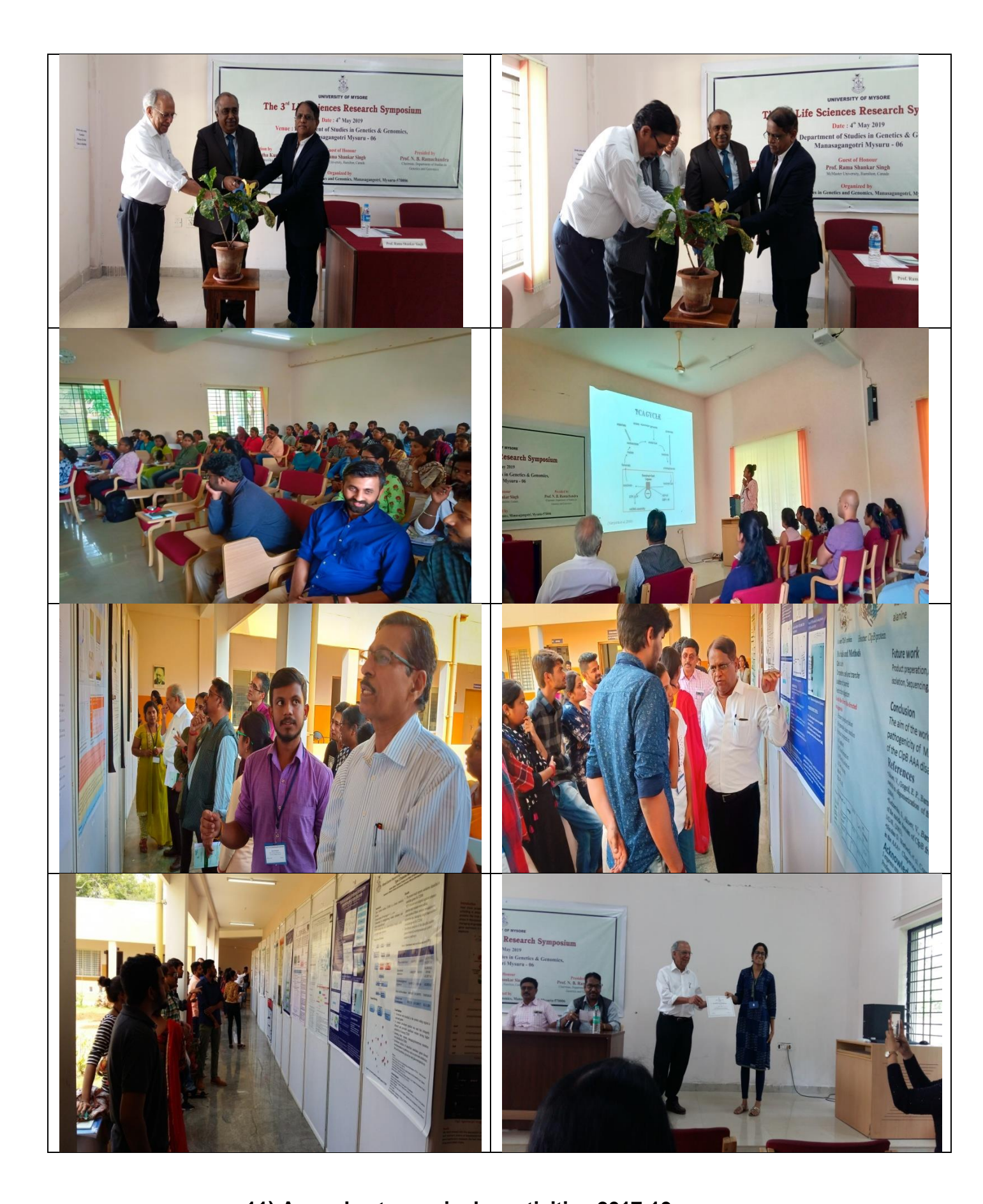
11) Annual extracurricular activities 2017-19