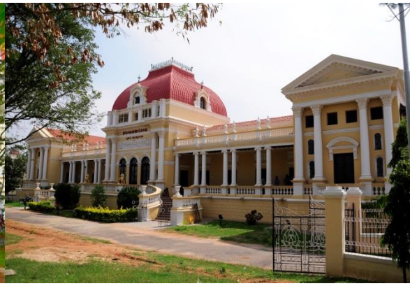
Oriental Research Institute (1891)