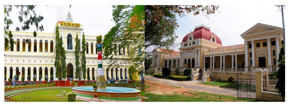
Maharaja's College (1889)