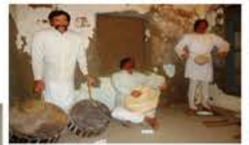
Indian Village Music