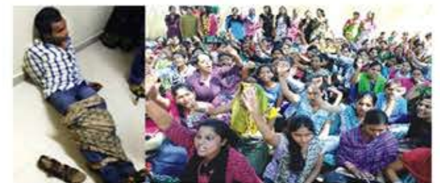
The man who was thrashed

Manasagangotri: A young man who reportedly trespassed into the women's hostel of Mysore University in Manasagangotri campus, was caught red handed and thrashed by the inmates. This wasn't the first time he trespassed. He had entered the hostel the previous day and was spotted by an inmate. Even though she raised an alarm, he managed to escape, said one of the inmates. The man has been identified as a diploma student hailing from Andhra Pradesh. Police said that the trespasser is deaf and dumb and is also mentally retarded.