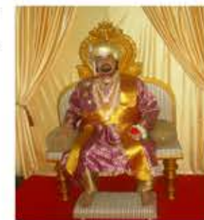
Wax statue of Wodeyar