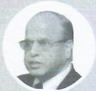
Padma Vibhushan Dr. K. Kasturirangan Chairman, National Education Policy -2020

National Education Policy (2020) - The Broad Contours